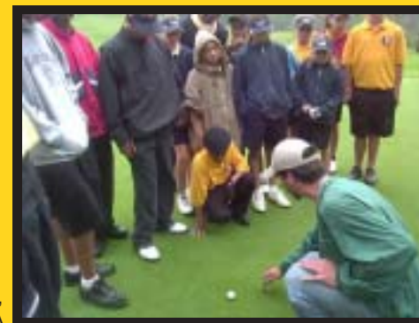
Golf Camp, Somerset PA