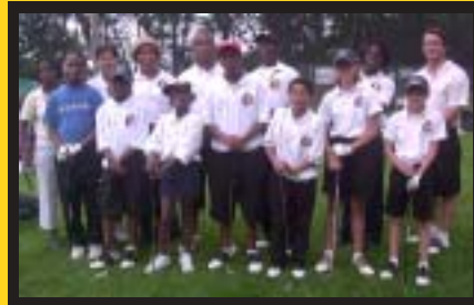
Eastern States Tournament Newark, NJ