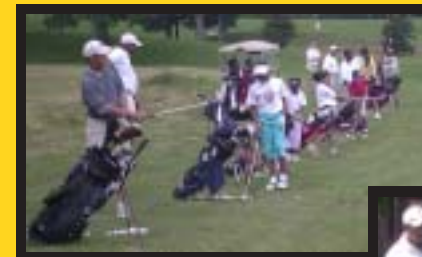
Golf Camp, Somerset PA