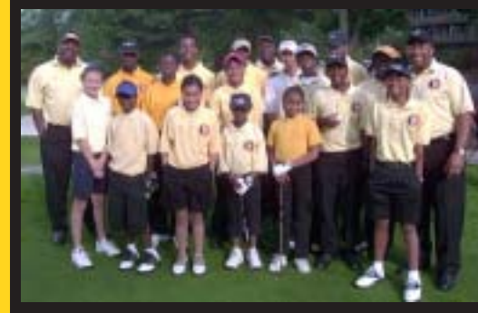
Golf Camp, Somerset PA