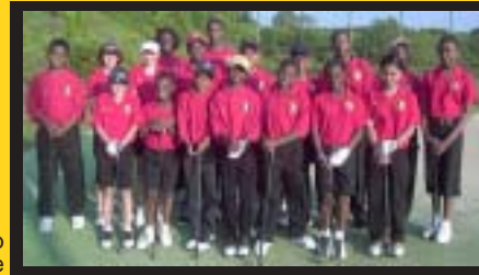
Main Group Golf Practice