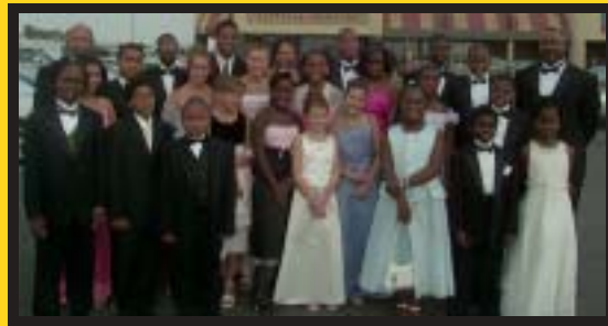
Black Tie Affair Oakmont C.C.

Please make all checks payable to: West Penn Minority Junior Golf Association 322 Mall Blvd., #165 Monroeville, PA 15146-2229 E-mail: wpmjga@aol.com Website: www.wpmjga.org